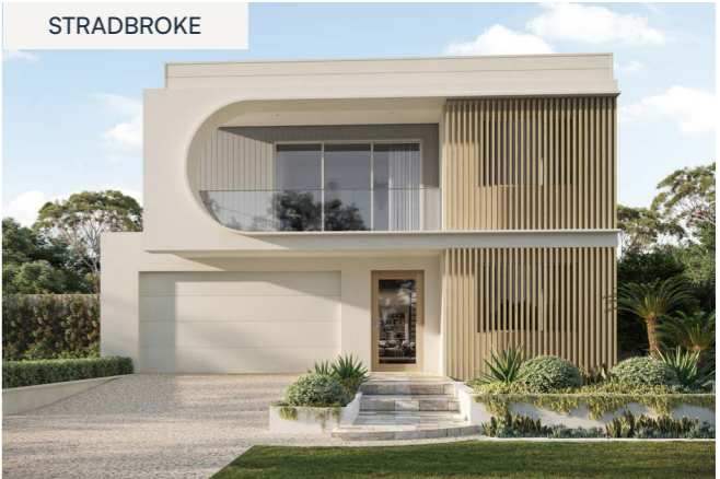
SHORELINE 34 Jingeri Street Redland Bay, 4165 Phone: 0405 106 911 4 3 3 2