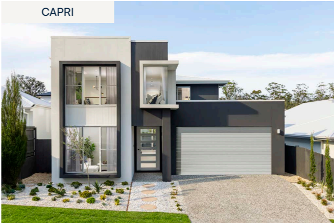
SPRINGFIELD RISE 20 Grafton Street Spring Mountain, 4300 Phone: 0411 575 769 4 2.5 3 2