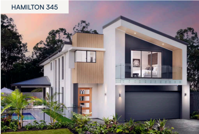
LOMANDRA PARK 34 Desertrose Crescent Bridgeman Downs, 4035 Phone: 0411 203 777 5 3 2 2