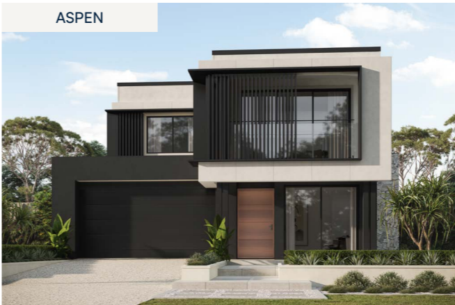
ROCHEDALE ARISE 186 Splendour Street Rosedale, 4123 Phone: 0413 680 014 or 0449 608 377 5 3 3 2